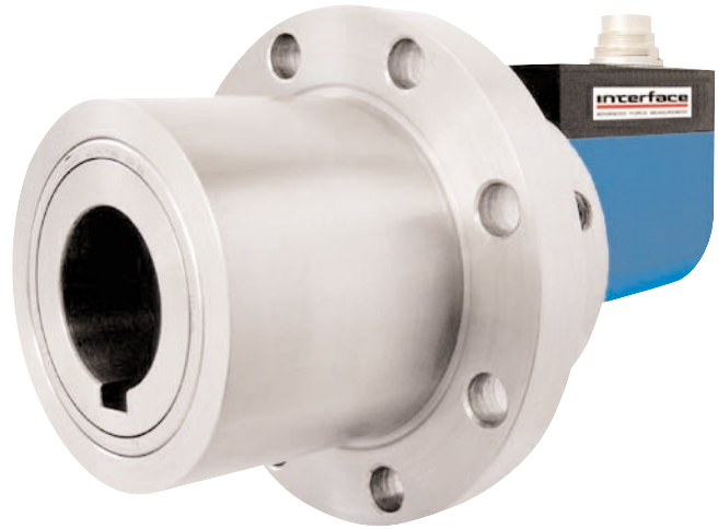
T22 Pulley Rotary Torque Transducer