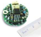
ICA5ATEX ATEX Intrinsically Safe, OEM strain gauge converter, 4-20mA 2 wire