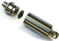
ILE Field enclosure for ICA analogue and DCell data converters